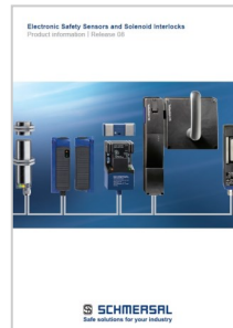
Electronic Safety Sensors & Solenoid Interlocks