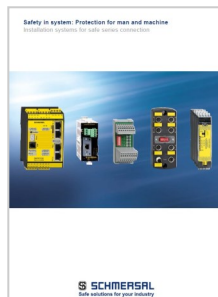
Installation Systems for Safe Series Connection