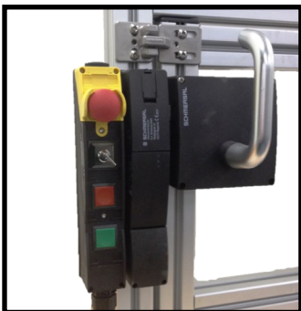
BDF200 fits standard housing extrusions and aesthetically matches our AZM201.