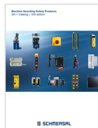
GK-1 Products Catalog page 2-18