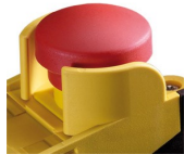
NHK Collared E-Stop Operator for position 1