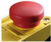
NH E-Stop Operator for position 1