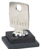
SWS20 Keyed Selector Switch with maintained actuation for position 2