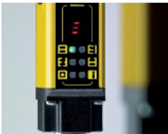
7 segment & LED display