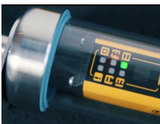
IP69 rated enclosure option for wash down applications