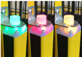
Output and reset status LED endcap